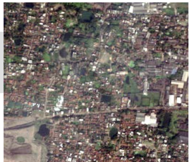
Fig 3 .Multispectral Image of IRS-P6

Initial qualitative visual inspections reveal that all the fused images have better qualifications than original non-fused images. The sharpness of the fused images has been significantly enhanced. The further quantitative evaluation can be done with above criteria.