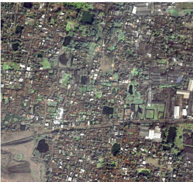
Fig 5. WT Based Image Fusion Result