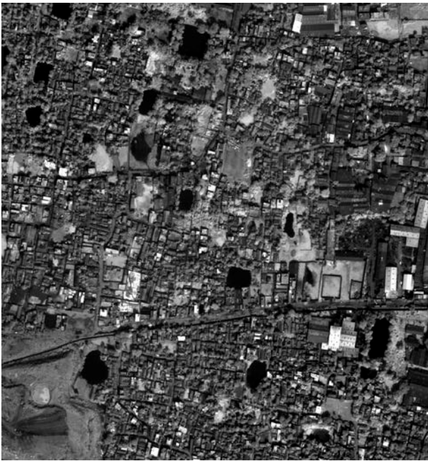
Fig 4. Panchromatic Image of IRS-P5