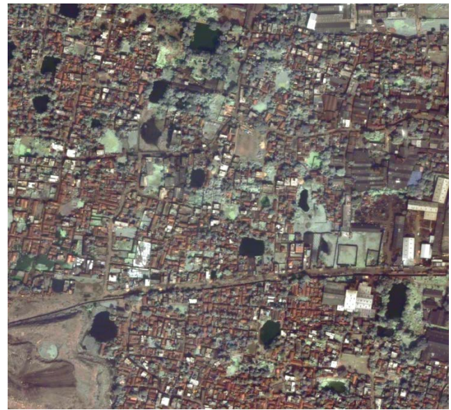
Fig 6. PCA Based Image Fusion Result